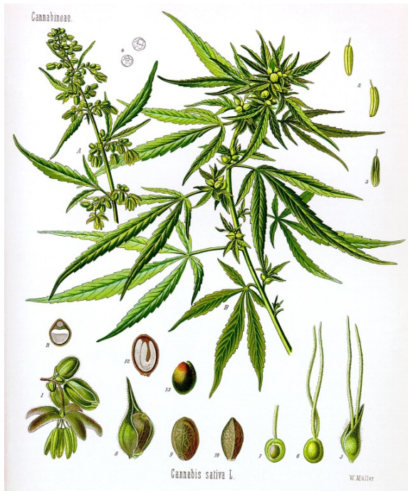
Hemp plant. A flowering male and B seed-bearing female plant, actual size; 1 male flower, enlarged detail; 2 and 3 pollen sac of same from various angles; 4 pollen grain of same; 5 female flower with cover petal; 6 female flower, cover petal removed; 7 female fruit cluster, longitudinal section; 8 fruit with cover petal; 9 same without cover petal; 10 same; 11 anther in cross-section; 12 same in longitudinal section; 13 seed without hull. Photo file: File:Cannabis sativa Koehler drawing.jpg Created: 31 December 1886 From Franz Eugen Köhler's Medizinal-Pflanzen . Published and copyrighted by Gera-Untermhaus, FE Köhler in 1887 (1883-1914).

Hemp needs less than half the amount of water needed to grow corn, and at least 14 times less water than cotton.